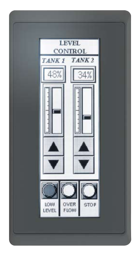
The HG1F is bright enough to be read easily in sunlight.